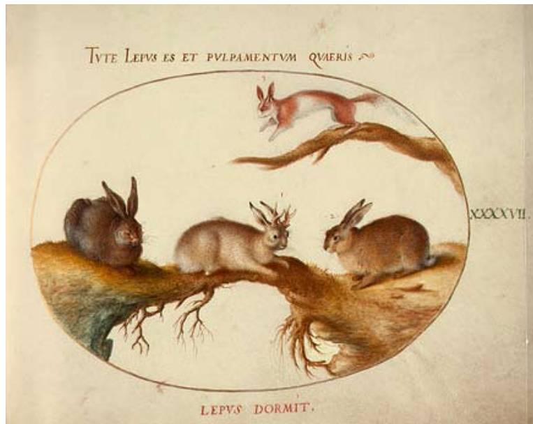
An illustration of a horned hare (center) from the late 1570s

Thus, while there may be a theoretical halachic problem involved with a shofar of a non-kosher animal, in practice no such shofar could exist anyway.