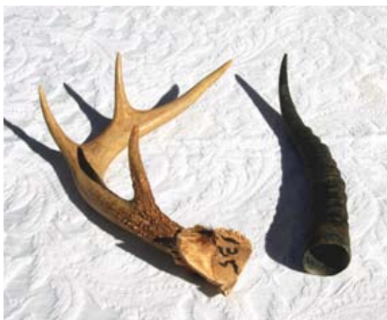
Left: Antler of a deer Right: Horn of a blesbok

The Shulchan Aruch rules that horns which are made of solid bone and have no removable core are not kosher for use as a shofar, even if one were to drill it out such that one could produce a sound from it. According to some, the basis for this ruling is that the word shofar implies something that is naturally prepared and beautiful (from the word shafrah , Psalms 16:6), which rules out a horn that has to be drilled in order to be turned into a shofar. 1 Others state that the word shofar innately refers to a naturally hollow structure, which is reflected in the word shefoferes , "tube." 2