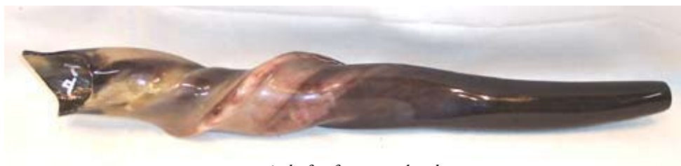
A shofar from an eland

By the same token, other exotic shofars that are occasionally available are likewise not the preferred way to fulfill the mitzvah. Ibex horns, which are the most expensive shofars on the market, are themselves mentioned in the Mishnah as not falling under the category of bent shofars. Eland, largest of all antelopes, possess huge, thick horns that are twisted but still mostly straight along the central axis. 6 Such shofars, beautiful and unusual as they may be, should therefore not be used when a curved horn is available.