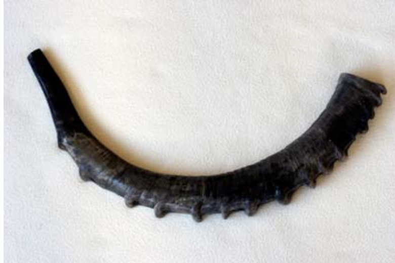
An ibex shofar

Yet by the time that a ram's horn has been turned into a shofar with the technique of heating and straightening the end to make the drilling easier, it is often no more curved than an ibex horn. Since the Mishnah requires a ram's horn to be curved, and it contrasts it to an ibex horn, then it appears that the full degree of curvature is required – i.e. a horn that is curled such that it is markedly different from an ibex horn. A shofar that has been partially straightened to facilitate drilling would not fulfill this requirement.