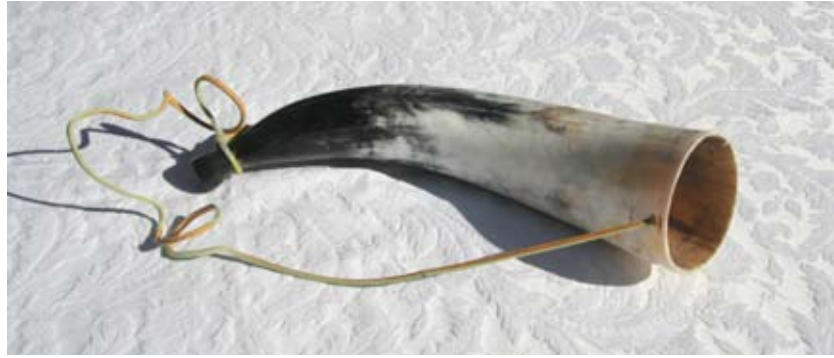
A (non-kosher) shofar of a cow

Talmud then gives the supplementary reason that due to the sin of the Golden Calf, it is inappropriate to use the shofar of an ox on the Day of Judgment. 26