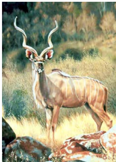
A greater kudu. Note how the tip of the horn, which is made into the mouthpiece, is at the top.

This is an astonishing conclusion; surely nobody has ever held an ibex or antelope shofar in that position. It is peculiar that no mention of this requirement is made by any other authority. It is customary in such cases to suggest a reason why other authorities may not have agreed with this requirement. Perhaps one can say that the requirement of derech gedelaso only applies where the mitzvah is the actual physical taking hold of the item. Such is the case with lulav and esrog , and in such cases the physical position of the item is significant. With shofar, on the other hand, it is debatable as to whether the mitzvah includes