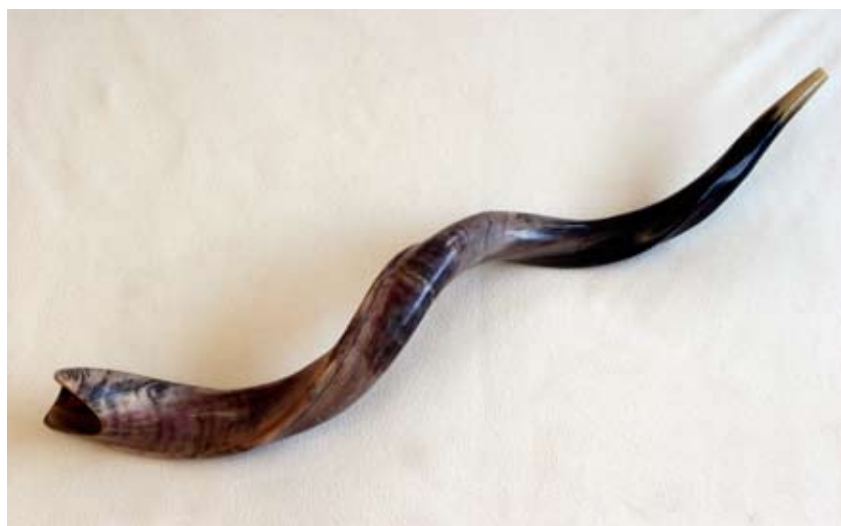
A Yemenite kudu shofar

Yet Yemenite Jews generally follow the rulings of Rambam, and Rambam ruled that a shofar made from any animal other than a sheep is invalid. How, then, did the custom arise