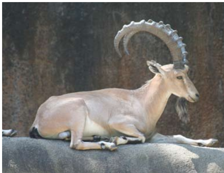
A Nubian ibex

The other view in the Mishnah is that the familiar ram's horn should be used for Rosh HaShanah, with the ibex horn being used for the shofar of Yovel (the jubilee year):