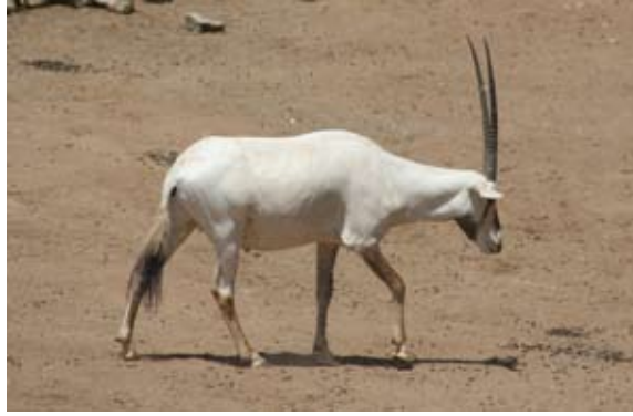
The Arabian oryx