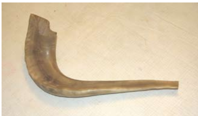
A shofar made of a partially straightened ram's horn

As discussed earlier, animal horns of the type suited to making shofars (as opposed to those of deer or rhinoceros) are made of a sheath of keratin covering a bony core. To turn the horn into a shofar, the bony core is removed and discarded, the tip of the keratin horn sawn off, and a hole drilled from the end to the hollow interior of the keratin. But drilling this hole can present difficulties. A ram's horn in its natural state is tightly coiled, and the hollow interior does not reach all the way to the end. There is no straight line between the end of the hollow and the sawn-off tip that can be drilled. To solve this problem, the horn is heated, thus rendering it malleable, and the end of it is straightened. A hole can then easily be drilled from the tip into the hollow interior. The result of this is that the shofar is partially straight.