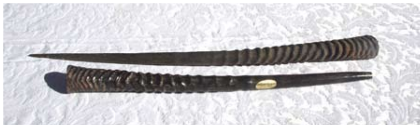
A gemsbok horn and a gemsbok shofar, complete with kosher certification

This raises a problem with an exotic shofar that is gradually appearing on the market. The “gemsbok shofar,” as it is commonly called, is made from the horn of an antelope: the southern African oryx, Oryx gazella , which is often referred to by the Afrikaans name of gemsbok. Its horns are about two and a half feet long, straight, ridged along half their length, and deep brown or black in color. They make for a novel and striking shofar that commands a price of between $100 and $250. Gemsbok shofars can be purchased from shofar manufacturers under rabbinic supervision and at many Judaica retailers. They have received publicity in Orthodox publications as exotic yet kosher shofars. But since they are straight, they should preferably not be used as shofars. Later, we shall raise other concerns with gemsbok shofars.