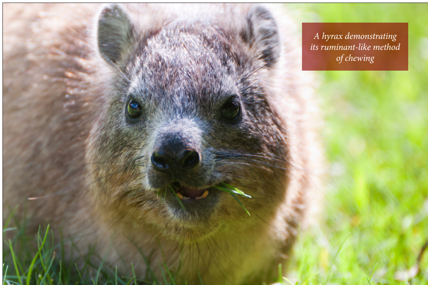
A hyrax demonstrating its ruminant-like method of chewing

But there is another possibility. There is a very limited form of rumination, called “merycism,” which is found in some Australian marsupials such as koalas and kangaroos, and in other animals such as proboscis monkeys. With merycism, the animal regurgitates a small amount of food, and it is not chewed as thoroughly as is the case with ruminants, nor does it play as fundamental a role in digestion. Still, this would undoubtedly be sufficient basis for the Torah to describe such a process as “bringing up the cud.” Hyraxes frequently make brief chewing movements with their mouths, long after they have eaten. There also appears to be movement in the throat immediately preceding these chewing motions. 40 Perhaps the hyrax engages in merycism, which would account for those who have claimed to observe it ruminating, as well as the Torah’s description of it.