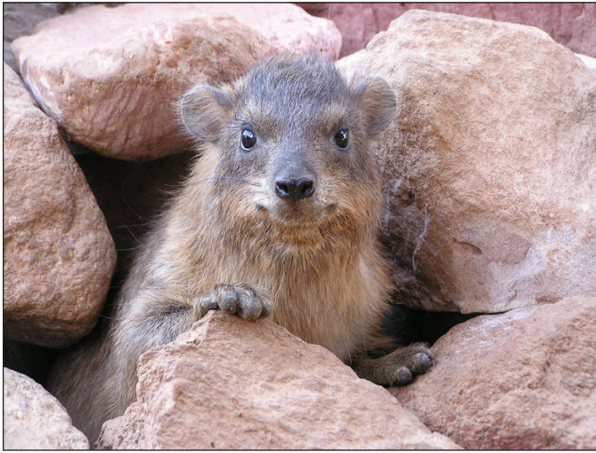
A hyrax emerging from the safety of its refuge

Jerboas are rodents, not ruminants, and they are not known to chew the cud. But it is possible that, like rabbits and hares, they engage in the process known as cecotrophy or refection. This refers to their reingesting certain types of fecal pellets that are specifically produced for this purpose; we shall discuss this process in more detail with regard to the hare. Many rodents practice such behavior. 26 Thus, it is possible that the jerboa practices cecotrophy, and that like the hare, the jerboa would be described as “chewing the cud” because of this.