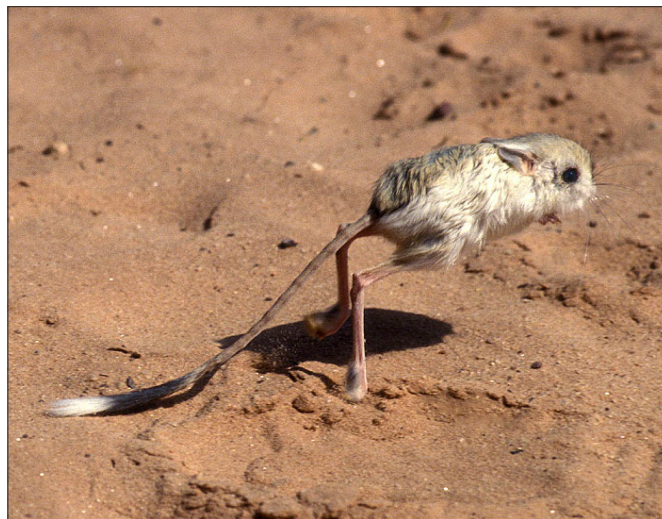
A lesser jerboa

Aware of the problems with identifying the shafan as the rabbit, some European investigators of the wildlife of the Bible sought to learn of a different animal in the Land of Israel that might be a suitable candidate. In the seventeenth century, Samuel Bochart, author of the Hiero-zoïcon —the first comprehensive study of all the animals mentioned in Scripture—argued that the shafan is the jerboa. 23 This is a small rodent that has long back legs for jumping and tiny forelimbs. Bochart had never seen a jerboa, but he was under the (mistaken) impression that it lives in rocks, thus matching the Scriptural description of the shafan . As further evidence, he argued that the Septuagint’s term chyrogrillius was a word referring to the jerboa, based on the authority of a fourteenth-century Copto-Arabic lexicon. 24 Following Bochart, the identification of the shafan as the jerboa was subsequently adopted by several Jewish and non-Jewish scholars; 25 as a jumping animal, it was also understood to be the tafza mentioned in the Aramaic Targum Onkelos.